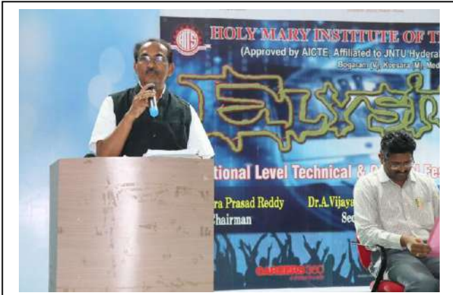
There were more than 150 registered participants for all the above events.