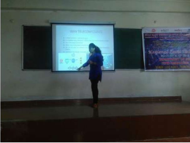
Photo s of event with guest and participants