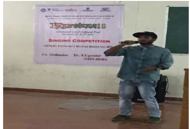
Photo s of event with participants

Various events such as Indian & western Group dance, Solo dance, Mime, Instrumental music, Indian & Western Solo singing, Duet singing, and Event photography were held at different venues simultaneously.