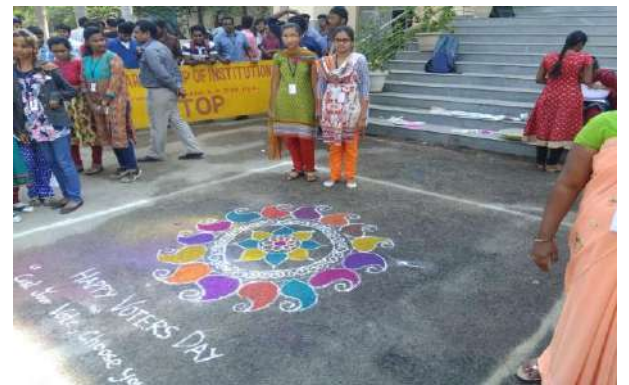
Rangoli drawn by ECE students