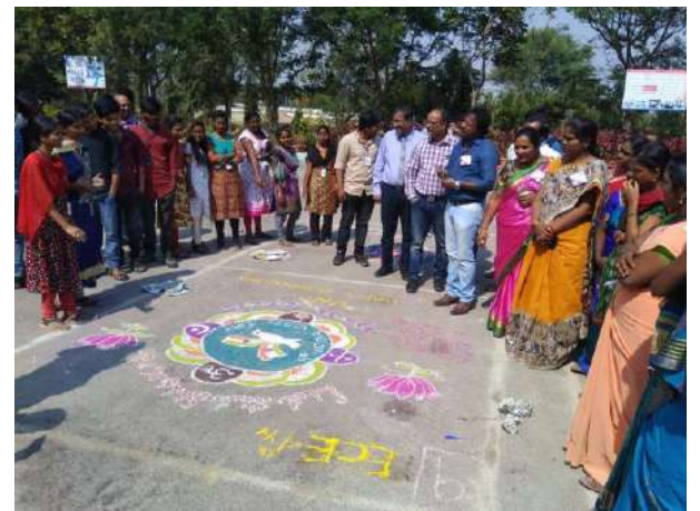
Rangoli drawn by the ECE Dept Faculties.