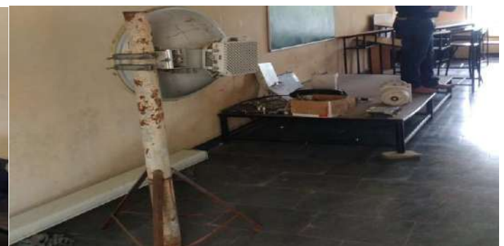
Practical Session on Network Generation Ports