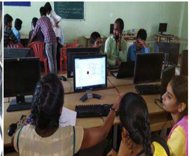
Designing circuits in software in hands on practice