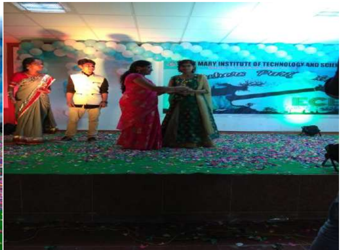
Mr.Fresher & Miss Fresher

A better way to celebrate Freshers Day will be a beautiful entertaining cultural extravaganza comprising of dances, melody songs, skits and humours choreography. The best venue is college campus and college management should extend their cooperation. Spending huge some of money is waste.