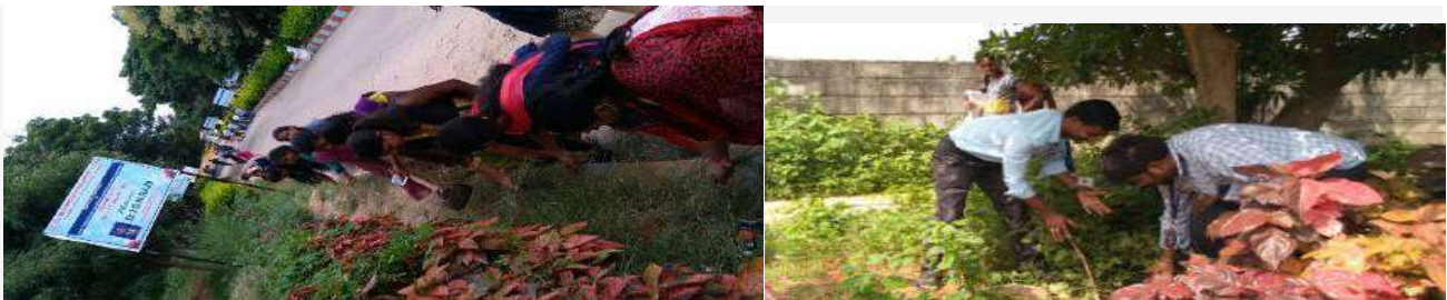
Students of Dept ECE and Staff were involving in the activities

A cleanliness week was observed from 1st September 2017 to 15th September 2017 , charged with a variety of activities ranging from students wielding the broom and cleaning the campus , identifying innovative ideas to maintain cleanliness, and teachers motivating students to inculcate maintain their surroundings by prioritizing cleanliness in the workplace.