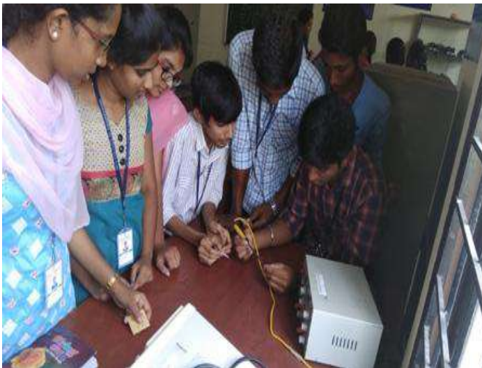
Students making soldering connections