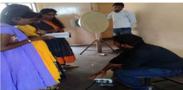
Practical equipments demonstration of antenna