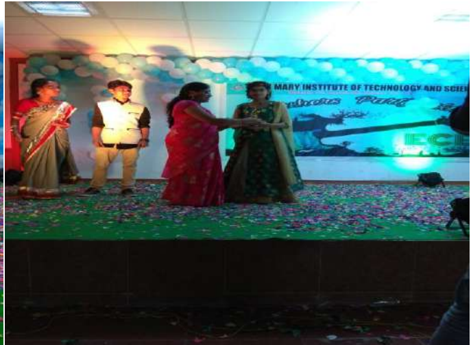
Mr.Fresher & Miss Fresher

A better way to celebrate Freshers Day will be a beautiful entertaining cultural extravaganza comprising of dances, melody songs, skits and humours choreography. The best venue is college campus and college management should extend their cooperation. Spending huge some of money is waste.