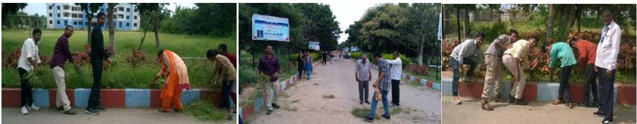
First Year Engineering Students participation in campus cleaning

As part of it Department of Electronics and Communication Engineering students, staff and HOD conducted various activities in the colleges and surrounding of college